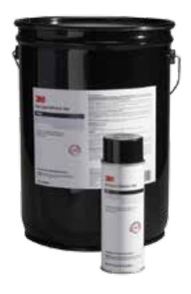
3M™ Dry Layup Adhesive is designed to reduce the amount of time required for dry layup of fiberglass. Ideal for robotic application. It also helps reduce wrinkles, which can be a major source of failures.

This sprayable, high tack and fast-drying adhesive is a synthetic elastomer-based formulation for bonding/holding glass fabrics and roving, other reinforcements and other materials (i.e. flow media) in place during the infusion process. Its particle spray pattern and color provide a visual check of spray level for more consistent application.